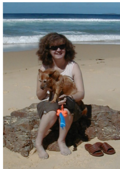
On the Goat Track

Finally, the weekend before ICCM-Asia saw people begin to arrive for the conference on IT and missions in Asia. 22 people attended the inaugural ICCM-Asia conference for the whole conference, with another 8 or so visiting for the odd session. We had 13 speakers present a number of topics. We managed to balance between technical and 'management' topics. Unfortunately we did not get many national IT workers, although we did have workers attending from Sri Lanka, India and Singapore, as well as cross-cultural workers from various locations, we had no Thai IT workers attend the conference. A committee has been formed to manage the next conference in 12-18 months, again in Chiang Mai.